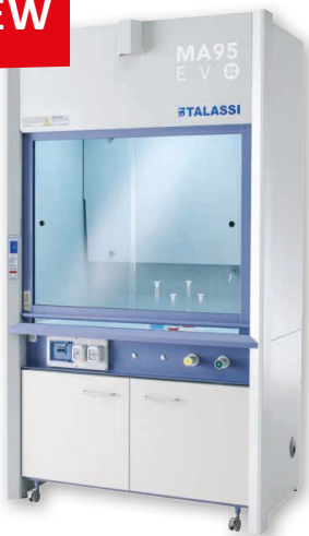
Fume hood with optional accessories. Further customization options are available on request.